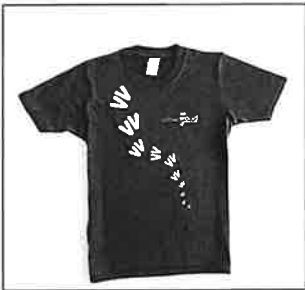
Robinwood T-Shirt - £10