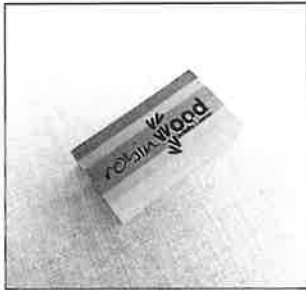
Robinwood Eraser - £1