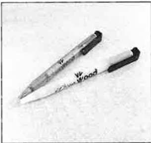
Robinwood Pen - £1,20