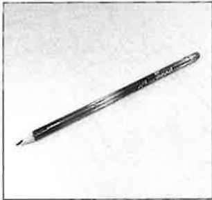
Robinwood Pencil - 60p