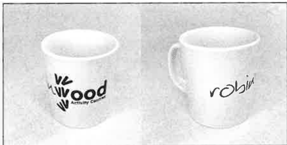
Robinwood Mug - £5